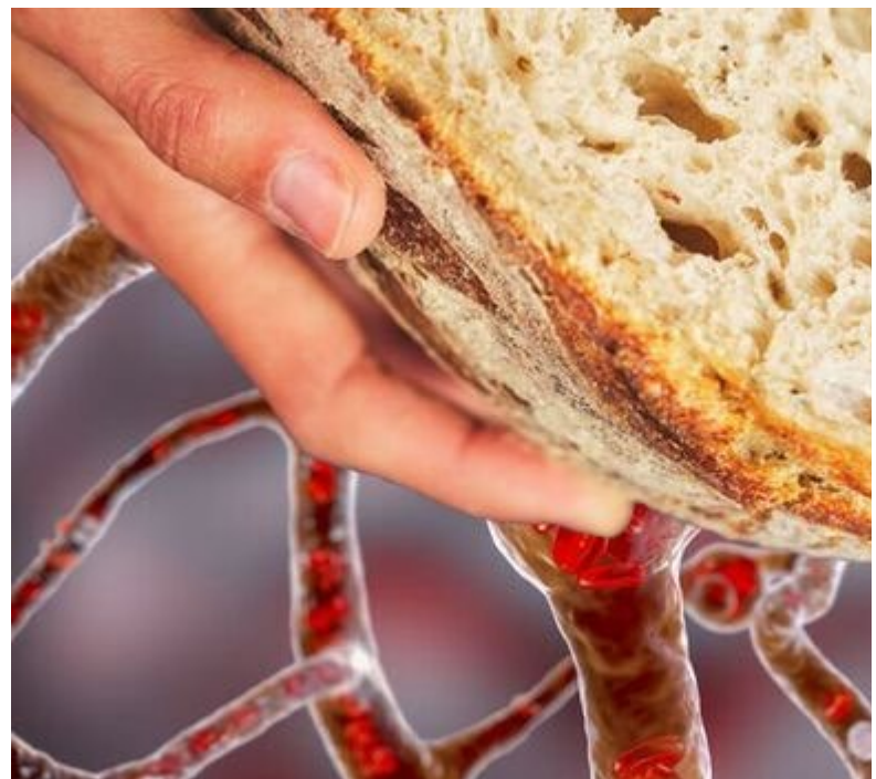
Inflammation from diet could lead to several diseases that interfere with blood clotting mechanisms